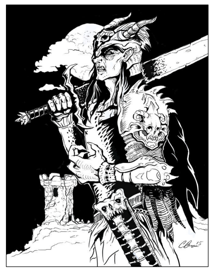
Hit points: A vampire gains 1d8 hit points at each level.