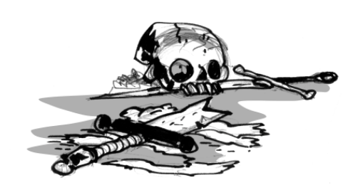
Table 2: Sword Monger Titles